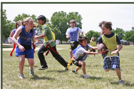
Meadow Lane Elementary School lunch intramurals