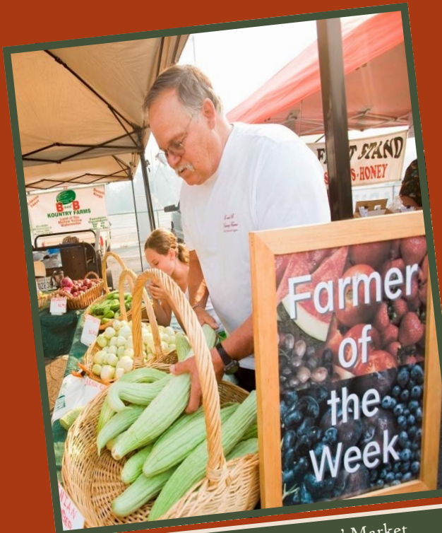
Visit the South County Farmers' Market Thursday mornings at Anderson Fairgrounds

Farmer of the Week highlights a farmer each week, helping our community learn about: