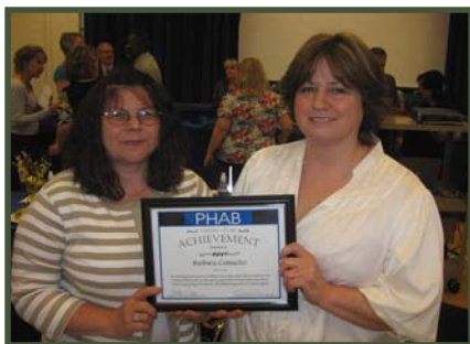
Anderson High School Food Service, receives recognition for Excellence in Public Health.